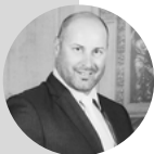
PRIMOŽ BRODNJAK Ambassador